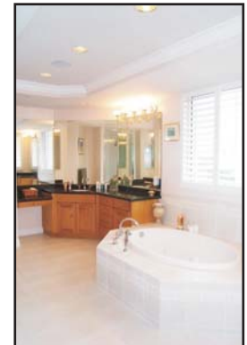
The Master Bath features a whirlpool tub for soaking your cares away.

Double entry doors open from the Vinoy Room to an exceptional Master suite, full of light from windows and its sliding glass doors. Its design allows for lots or little furniture, whichever you prefer. A hall leads to the walk-in closet, expertly crafted with organizational storage made charming with wood and brass tones. You'll absolutely adore the Master Bath! A continuation of the granite counters and wood cabinetry makes this room warm and inviting. An upgraded whirlpool tub graces the center of the room, separating the two vanities. There's also a large shower surrounded with ceramic tile and encased in glass. Light ceramic tile floors keep this room bright, and lots of mirrors add depth and drama. Plantation shutters ensure your privacy but allow a glimpse of the north view.