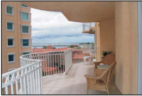
Above, looking south from the balconies outside the Master and second bedrooms. Below, looking north.