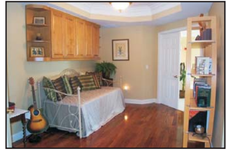
The versatile "Vinoy Room" can be used as a media den, a home office or any number of applications.

One wing of the home encompasses all three of the bedrooms and also your utility features. Aside from the powder room, which will be a treat for your guests, with a wood chest adapted as a vanity and hand-stenciled walls, this section of your home is your private retreat. The hall opens to a unique feature of this community, the "Vinoy Room." In this particular home, the kitchen cabinets displaced by the removal of the partial wall have found a new home here, adding custom storage and display space to this incredibly