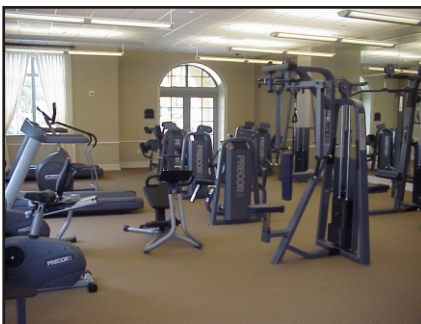
You'll appreciate all of the recreational amenities at Parkshore!