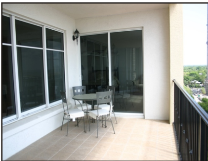
There's a nice-sized balcony with water views and overlooking the pool.