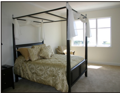
The Master suite has a lavish bath and a large walk-in closet.