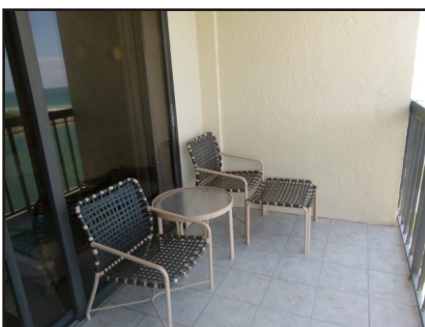
Relax on the balcony or enjoy the many community amenities.