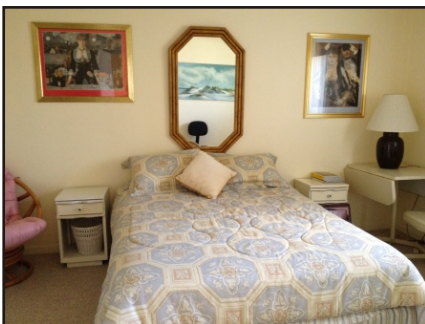
There's a second bedroom and a hall bath for guests.