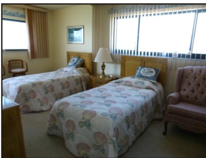
The Master suite features a full bath with large shower.