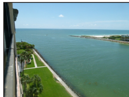
It's all about the view, north to John's Pass or west to the Gulf of Mexico.