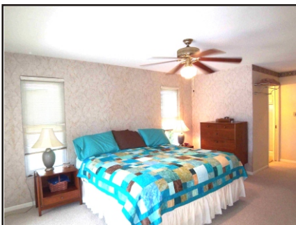
The Master suite has a walk-in closet and an updated bath with shower.