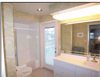
A large, bright bath serves the pool and both other bedrooms.