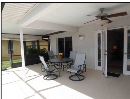
You'll likely spend most of your time on the lanai or down at the dock!