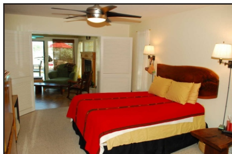
The Master suite has a private bath and lots of closet space.