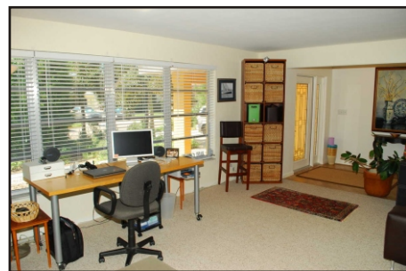
The living room is currently set up as an office, with great front views.