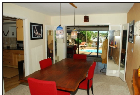
The dining room has a great view out to the pool and water beyond.

*Pinellas County Property Appraiser estimates that 2010 taxes without any exemptions would be $6,190.