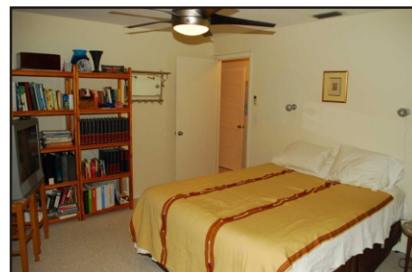
The other two bedrooms are on the opposite side of the home.