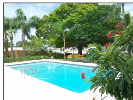
Relax on the enclosed porch or take a dip in the large swimming pool.