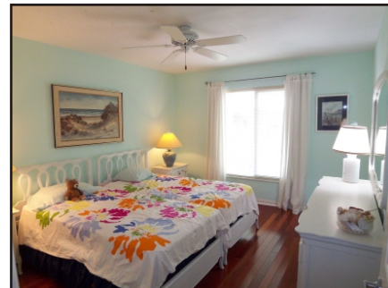
Two other bedrooms upstairs share a hall bath.