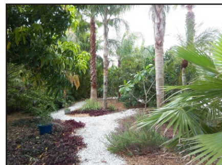
Meandering pathways through lush landscaping lead down to the water's edge.