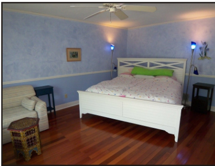
The Master suite overlooks the water, and has a private bath and walk-in closet.