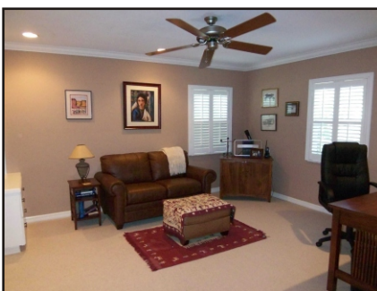
The third bedroom is spacious, and the fourth makes a great home office.