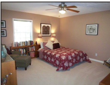
This bedroom suite is ideal for guest accommodations.