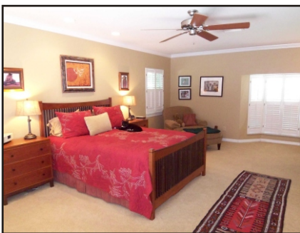
The Master suite is a true retreat, with a gorgeous remodeled bath.