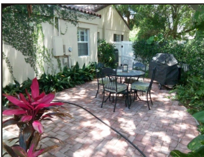
You'll find lots of places to enjoy outdoors, on the patio or down at the dock.