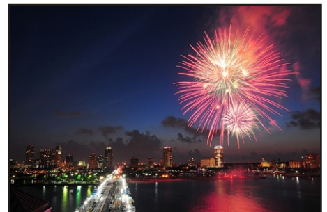
You'll love being in the heart of all the vibrant activities in downtown St. Petersburg. There's always something to do!