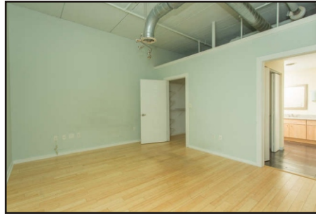
The bedroom is spacious, with high ceilings, exposed duct work and plenty of extra storage space above the closet.