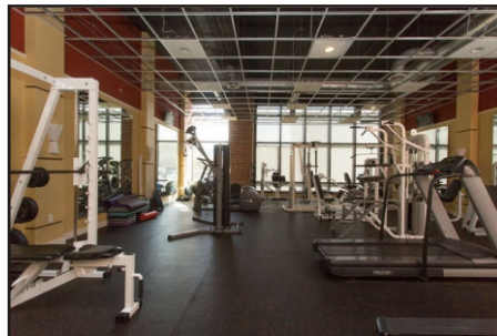
The building has a nice fitness center and common areas on the ground level. There's space for owner gatherings or private socials.