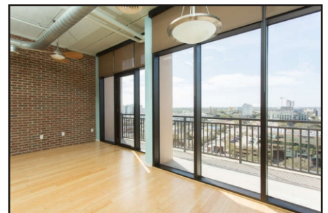
The unit has a wall of windows opening out to a balcony looking west over the city; great sunset views!

Come see for yourself how much you'll love living here!