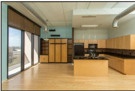
The kitchen features granite counter tops, wood cabinetry with plenty of storage, and an island for barstools. A clever murphy bed offers attractive storage for extra guest space!

Experience the urban lifestyle in this true loft style condo, a great room floor plan with exposed brick and duct work. The open space is flexible for however you choose to live. A wall of windows keeps things light and bright. Your