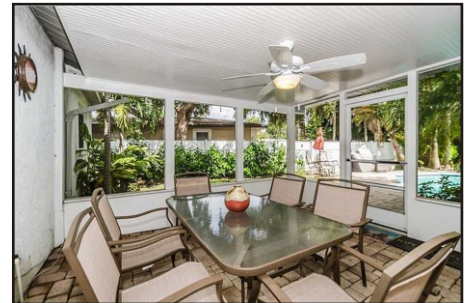
You'll absolutely love the screened patio and the back yard pool!