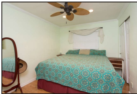
There are three bedrooms; this one is the first you'll come to.