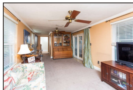
The versatile Family Room has French doors out to the screened patio.