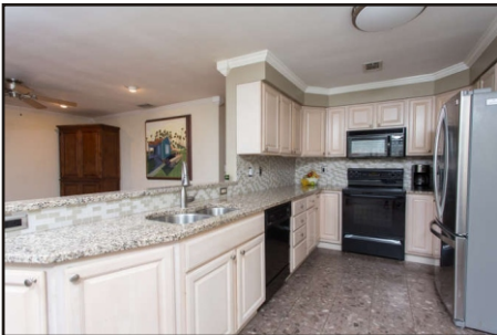
Just inside are the living room and the kitchen.

You have to see for yourself today how much you'll enjoy living in this home - make an appointment today!