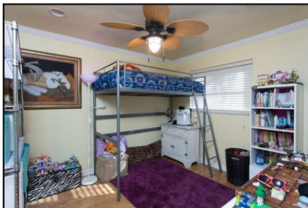
These two bedrooms are around the corner. There's newer wood-look laminate flooring in all of the bedrooms.