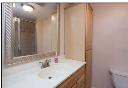
The second bath is also nicely updated, with a walk-in shower.