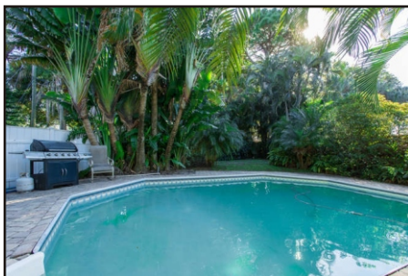
This back yard and pool will make you think you're on vacation every day!