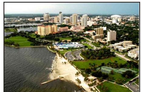
In the heart of vibrant downtown, just five blocks from the waterfront parks.