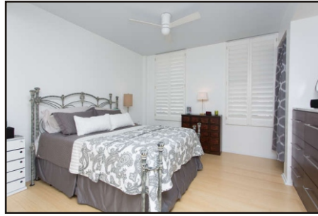
The Master features a built-in wardrobe and a lavish bath with walk-in shower.