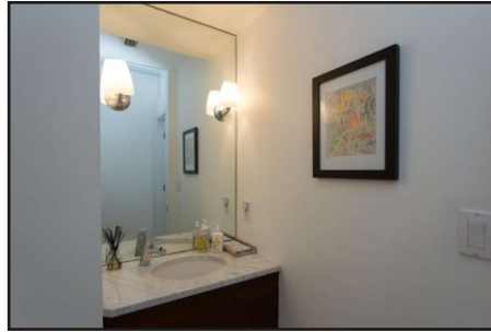
You'll love the high-end materials and finishes throughout every room.