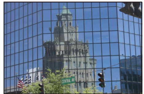
The distinctive Mediterranean Revival architecture is a favorite for photographers.