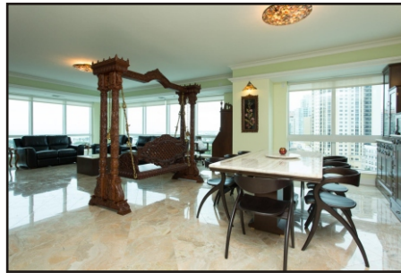
The great room features marble flooring and floor-to-ceiling windows.