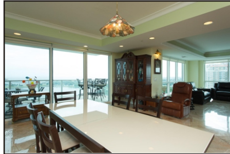
There's casual dining space and a large balcony to enjoy the views from.