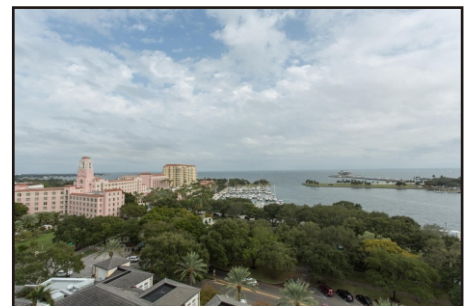
You'll love the views of Tampa Bay, from the balcony (above) and the great room (below), with floor-to-ceiling windows.

All of this is in the heart of vibrant downtown St. Petersburg, a place you'll love to call home. See for yourself how much you'll enjoy the downtown urban lifestyle!