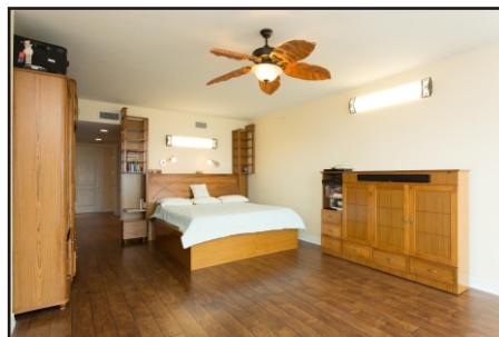
The spacious bedrooms have elegant engineered hardwood flooring.