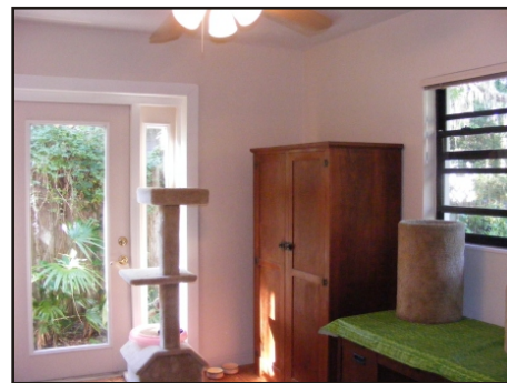
This bedroom enjoys a French door leading outside.