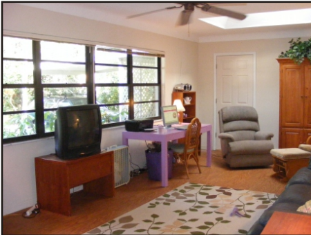
A large skylight makes the living room bright and airy.