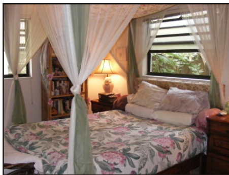
This is one of the two bedrooms in the southern wing of the home.