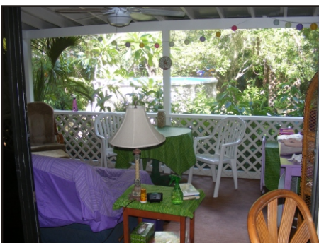
You'll probably spend most of your time on this great screened porch!

This cute home in Gulfport will be your personal refuge from the busy world! Block construction keeps the inside cool, but lots of windows and a large skylight in the living room keep it bright and sunny. The landscaping all around is easy to maintain, designed to thrive in the Florida climate.