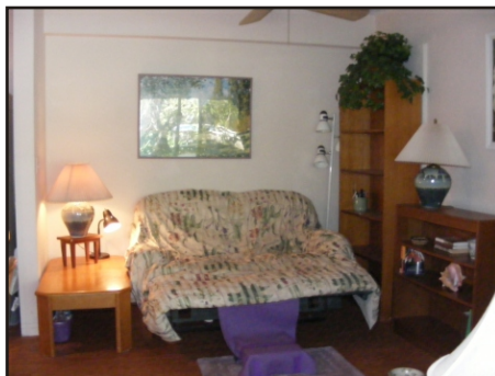
Originally the dining area, this space makes a great family room.