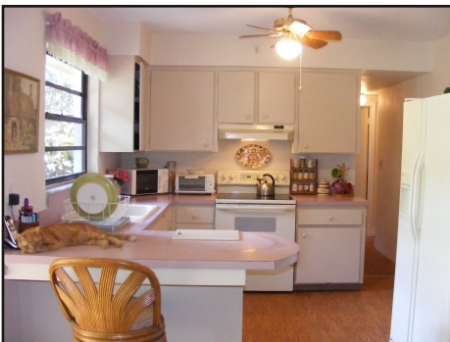
The kitchen has a casual dining counter and lots of work space.