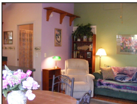
The Master suite is ideal for an in-law apartment, with ample room for a sitting area and sleeping area, and a spacious kitchen area.