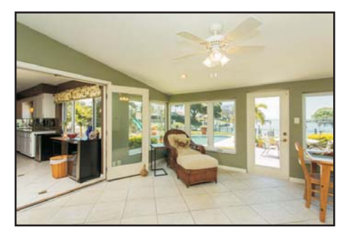
There's a family room with gas fireplace (above left) and a sunny Florida room.