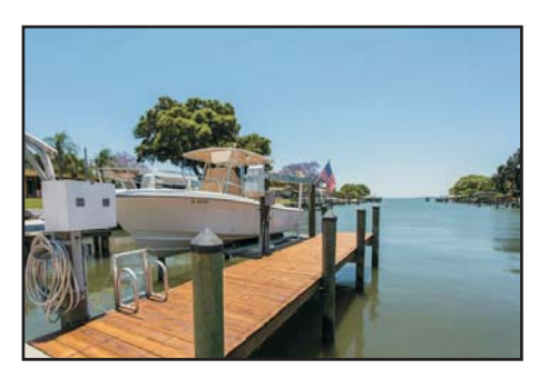
You'll spend lots of time outdoors, in the pool, playing in the yard or on the dock.