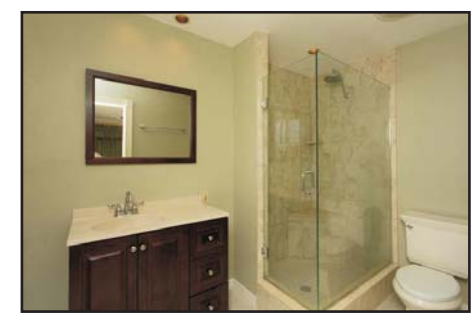
The Master suite features French doors and a totally remodeled private bath.