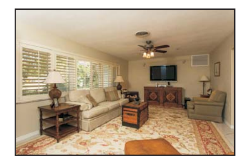
The floor plan is very flexible. Above is the living room. Below is the dining room and adjacent family room.

Conveniently located with easy interstate access, the greater Pinellas Point neighborhood is a great place to call home. Come see for yourself how much you'll enjoy living here!