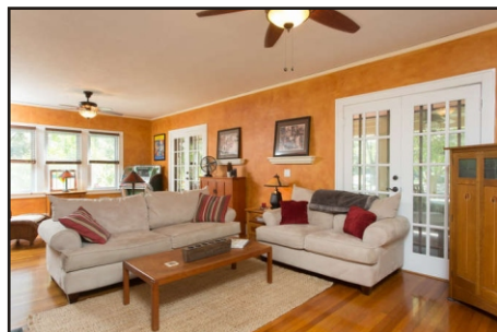
There's a large living room with a wood-burning fireplace, and a formal dining room with a pantry closet.

The location is ideal - around the corner from organic groceries, shops and restaurants, and just a few miles from vibrant downtown St. Petersburg. Access to I-275 is a snap, too. Come see for yourself how much you'll love living here.