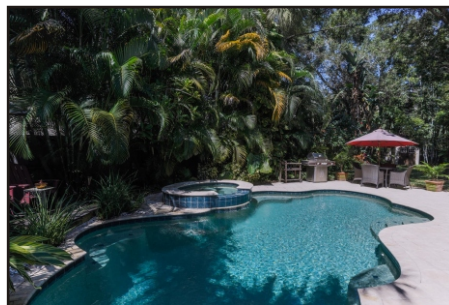
You'll fall in love with the pool & heated spa with lush tropical landscaping!