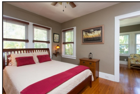
The original sleeping porch (above right) offers flexible space to meet your needs.