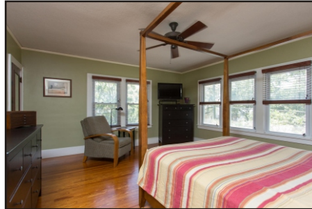
The bedrooms are large, and there's a surprising amount of closet space!