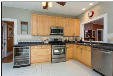
The kitchen features upgraded stainless steel appliances, wood cabinetry and brand new counters.

Front porch charm. Backyard oasis. Income bonus. Beautifully renovated, this classic 1935 Woodlawn two-story home emphasizes the character of its heritage with the modern comforts you expect. The enormous front porch with original Cuban tile invites you to sit and relax. Inside, oak and heart of pine wood floors, a