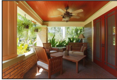
You'll love the enormous front porch with original Cuban tile (swing negotiable!)